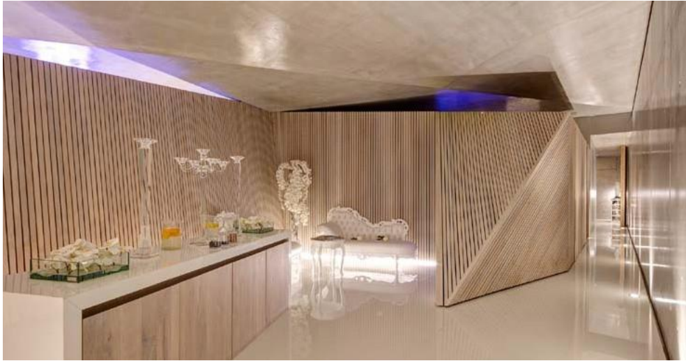
Spa & Wellness Area