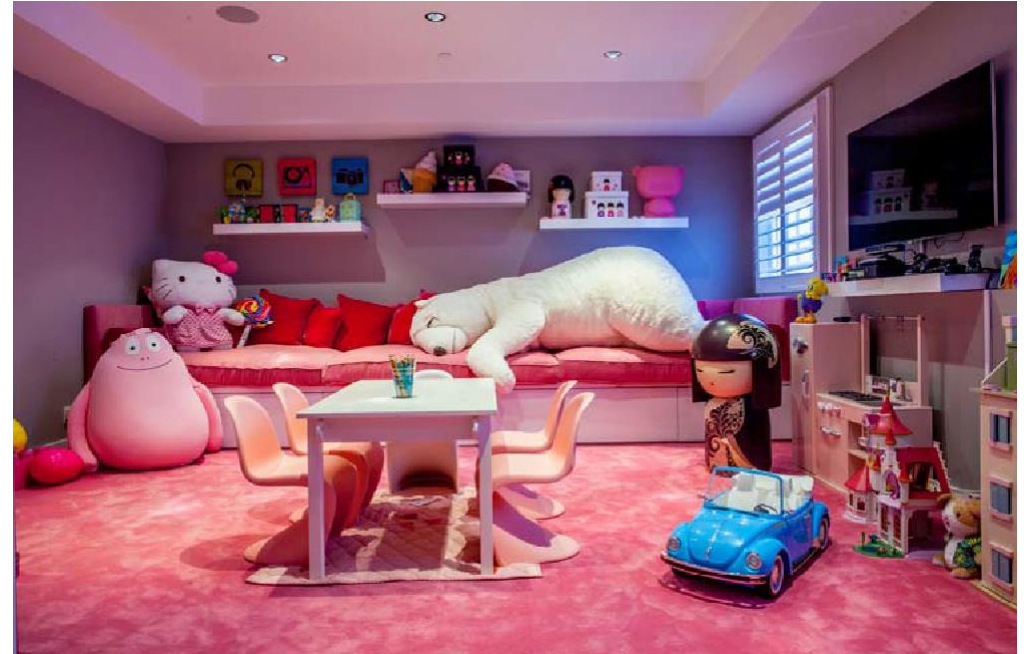
Childrens play rooms, totally equipped for boys and girls under 8.