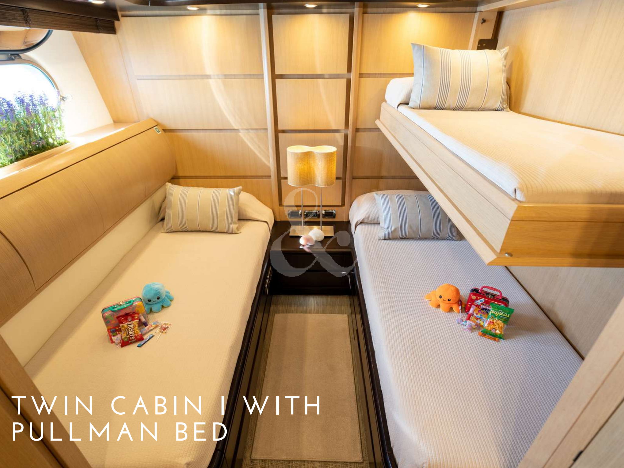
TWIN CABIN I WITH PULLMAN BED