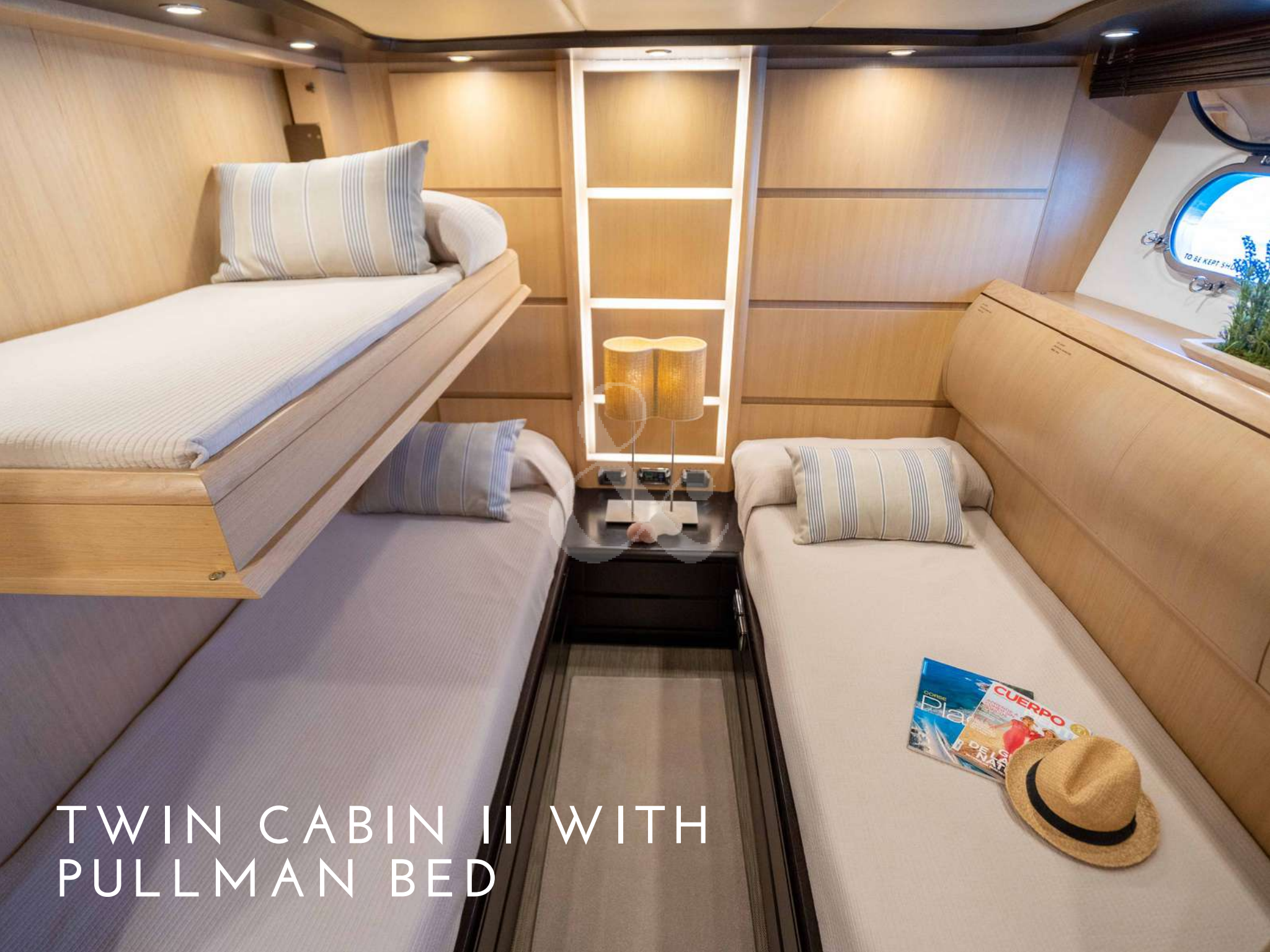
TWIN CABIN II WITH PULLMAN BED