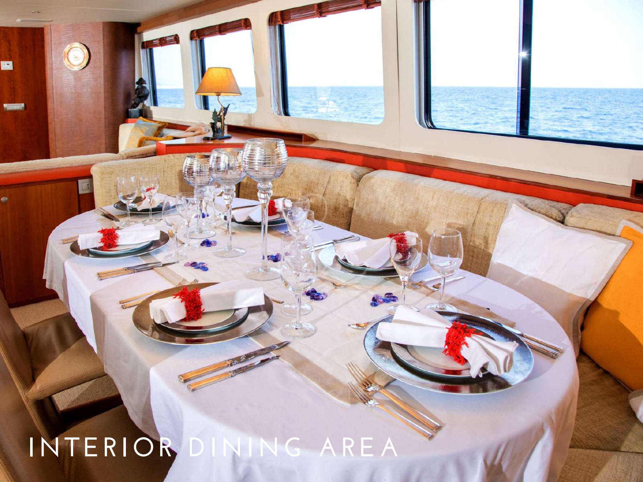
INTERIOR DINING AREA