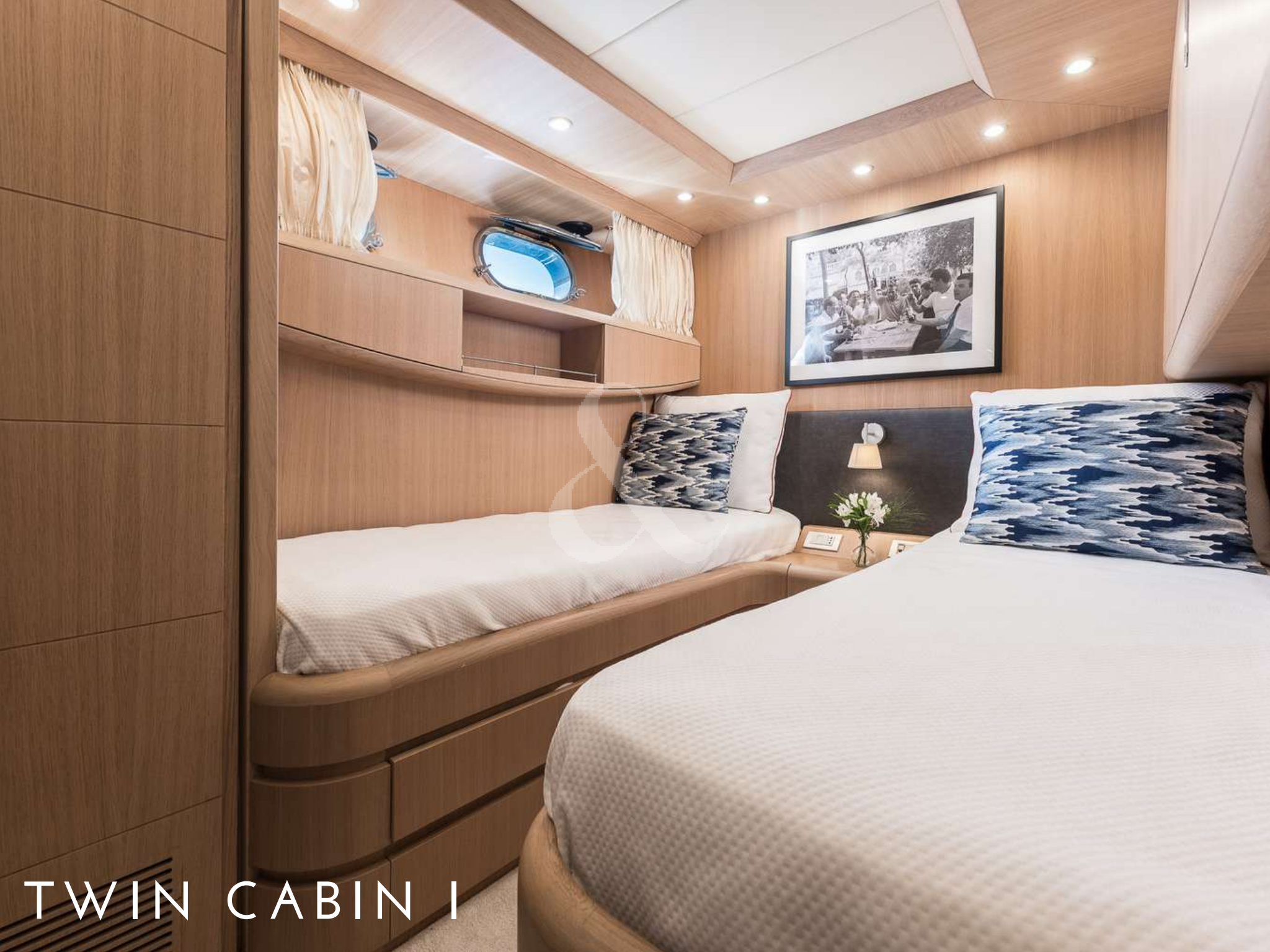
TWIN CABIN I