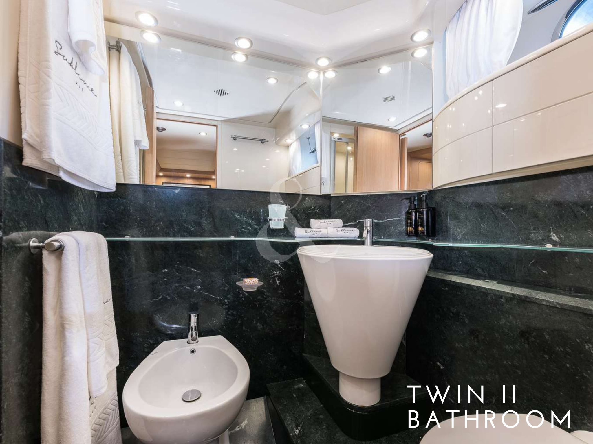
TWIN II BATHROOM