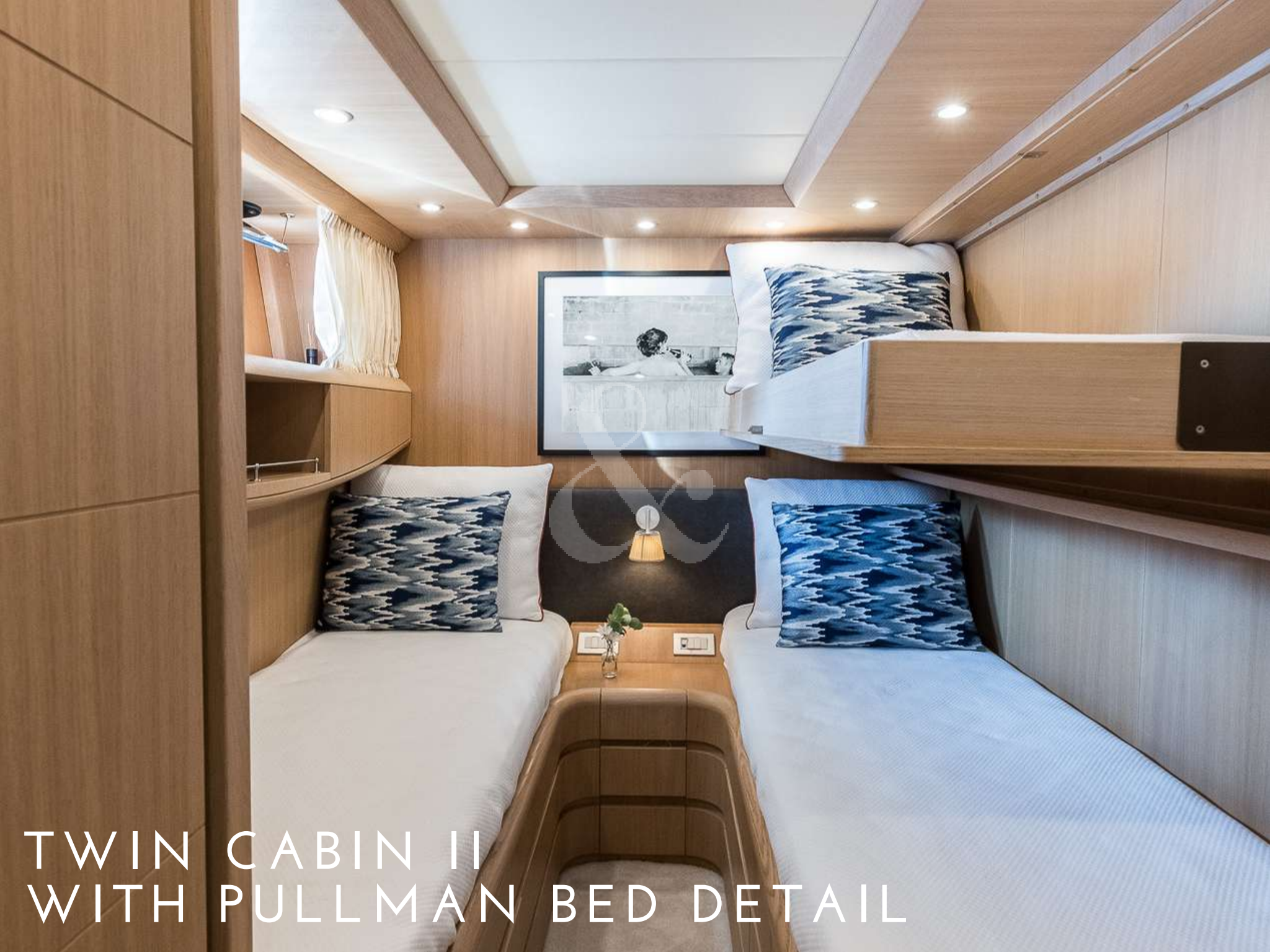
TWIN CABIN II WITH PULLMAN BED DETAIL