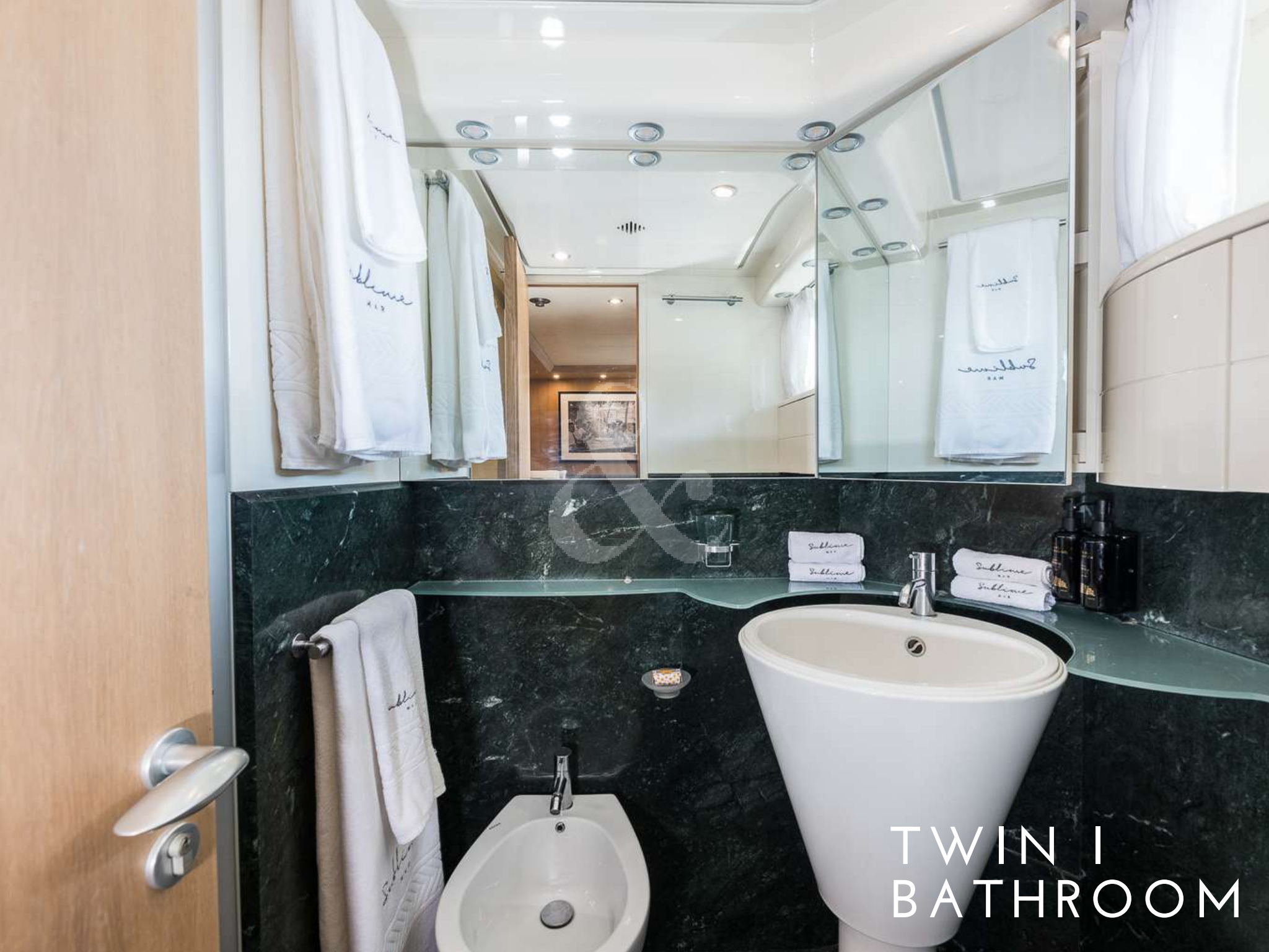
TWIN I BATHROOM