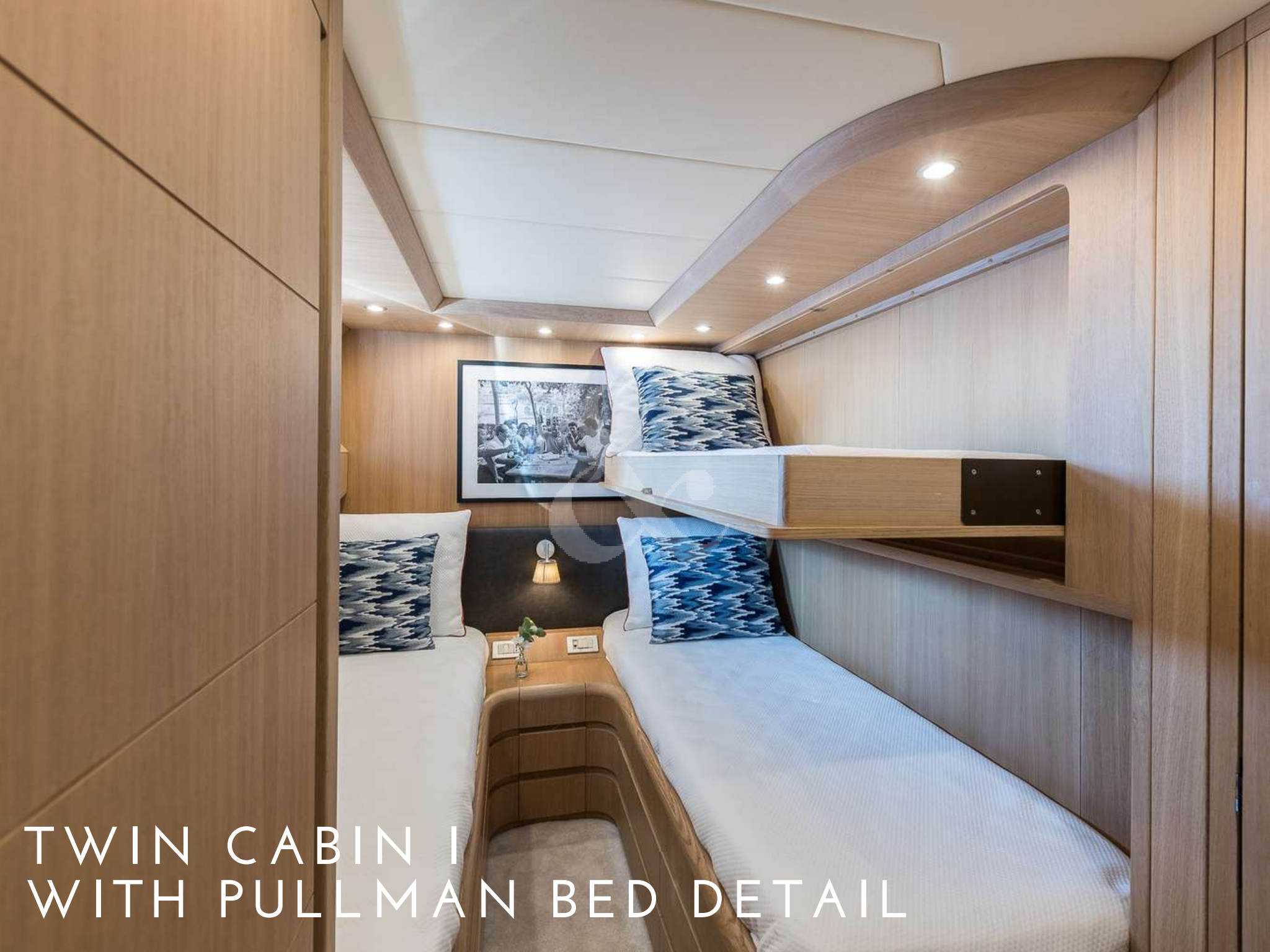
TWIN CABIN I WITH PULLMAN BED DETAIL